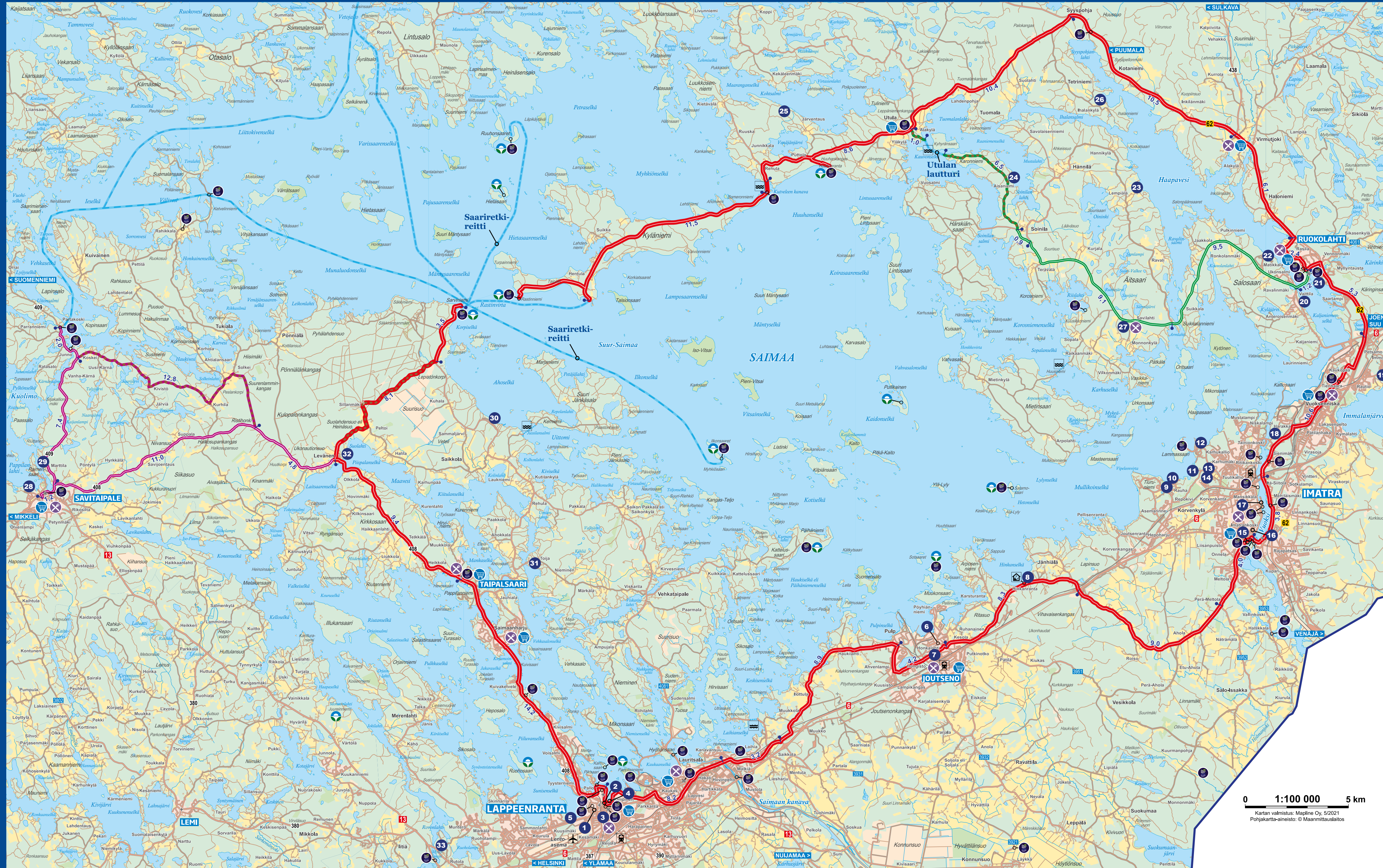
0 1:100 000 5 km